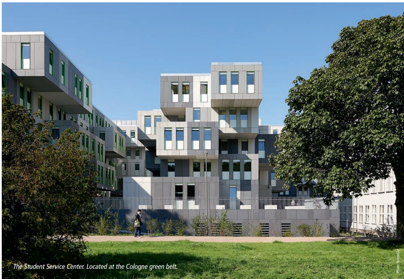
The Student Service Center. Located at the Cologne green belt.